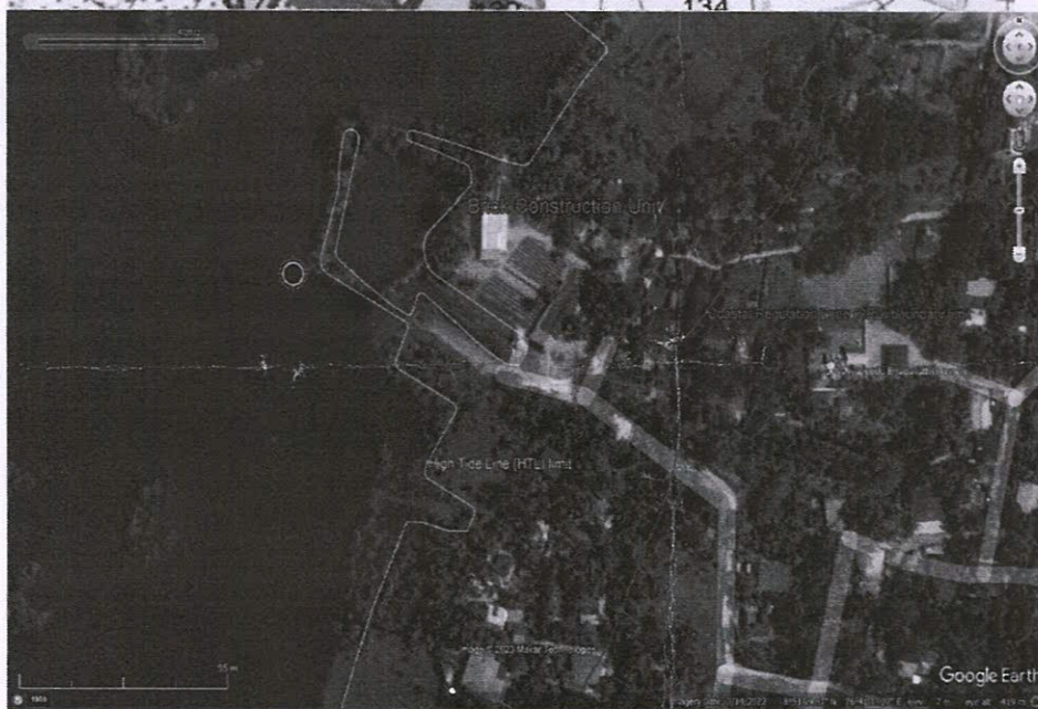
Google earth Image and The CZMP, 2011 Map of the location of Brick construction unit.