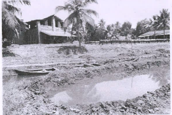
Fig: Brick kilns located along the banks of the river.